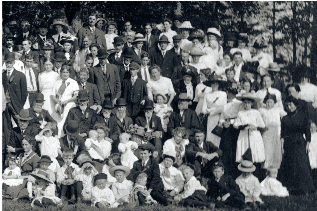
The Reunion of the «Old Boys» 1912 - The Descendants of the First Settlers